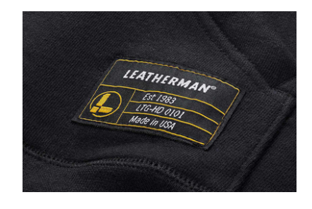
Photo 5 I want a woven label sewn at the top of the kangaroo pocket.